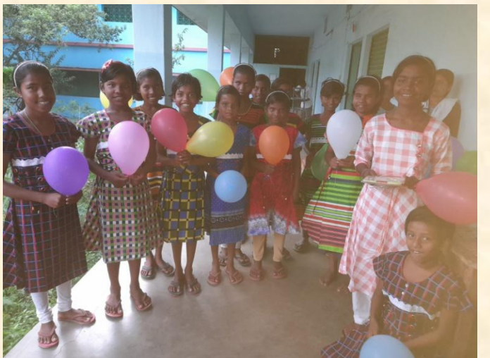
Cloth distributed at Umanivas