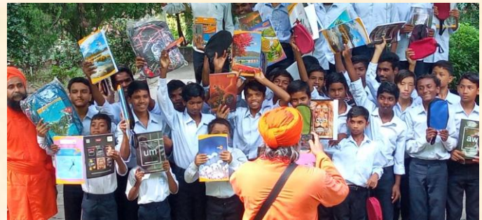
Activities on the last day of the Autumn Festival