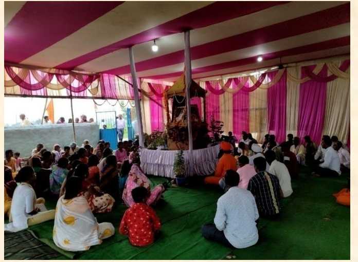
Akhanda Kiirtana and lishvarapranidhana on the day of Aśtamii at Kamukhap village