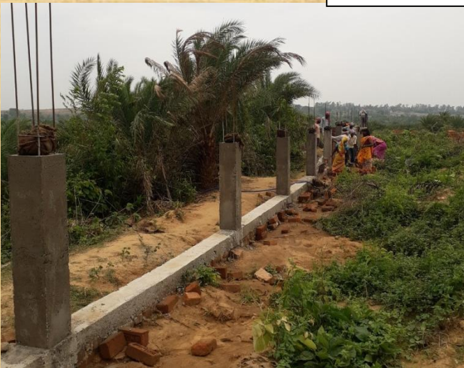
Boundary construction at Bansgarh by Farm Department