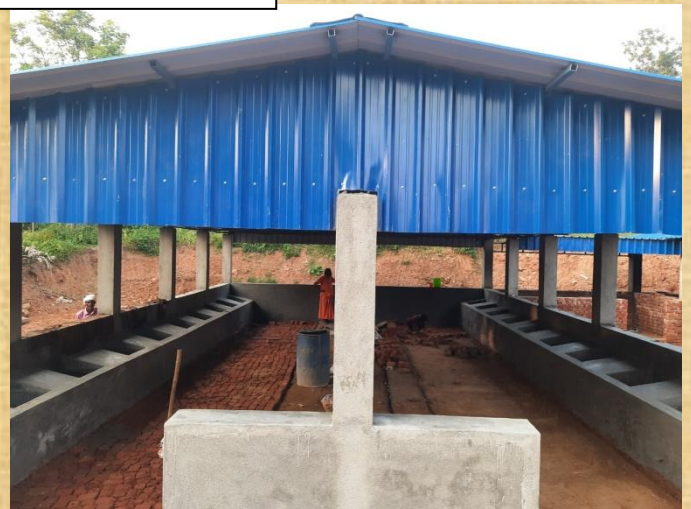
New cow-shed at Central Farm House