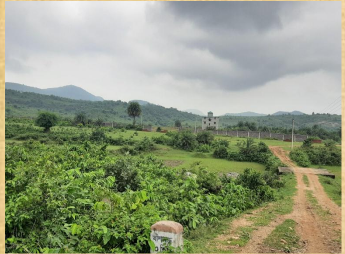
New Rest House at Bansgarh