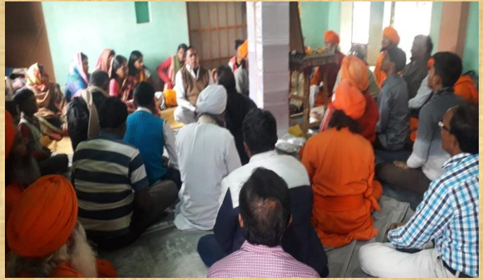
17 th December: As a part of village pracar (propaganda) program of Ananada Marga philosophy and spiritual cult, there was three-hour Akhanda Baba Nam Kevalam Kiirtana with collective Ishvar Pranidhan (Prabhat Samgiit, Kiirtana, Meditation, Guru Puja, Svadhyay), Tattvasabha, Kiirtana procession and mass feeding in the village Jeodaru. This program was organised by a young team of Jeodaru Ananda Margiis.