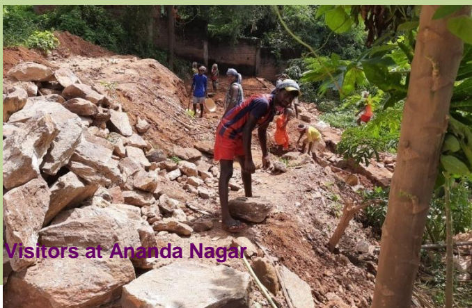
Visitors at Ananda Nagar