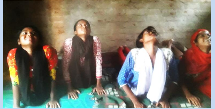
At Rajuardih Village where ten persons took initiation into meditation