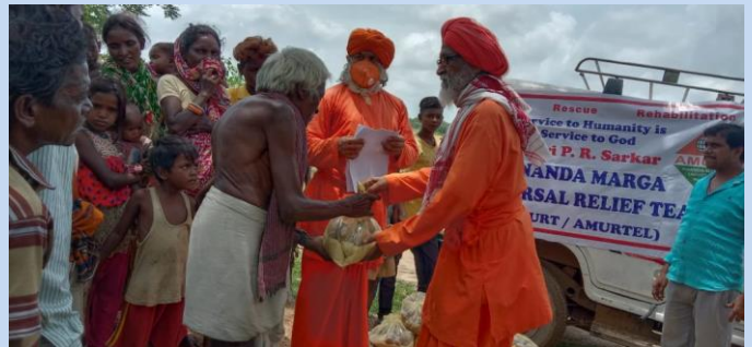
Relief on 10 th August at Hinjori, Shyampur and Kosangi villages, about 600 persons benefited