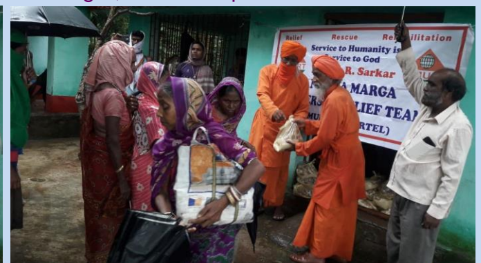
Relief on 16 th August at Sulanglahar, Sarjumahato and Khatanga villages, 240 persons benefited