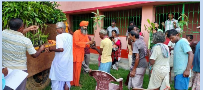
Fruit tree saplings distribution