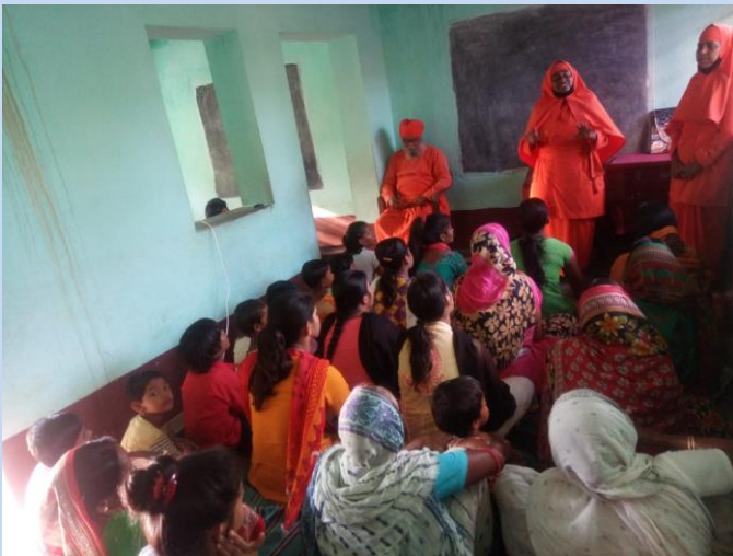
At Sidhi Village on 29 th August and 17 persons learned spiritual meditation