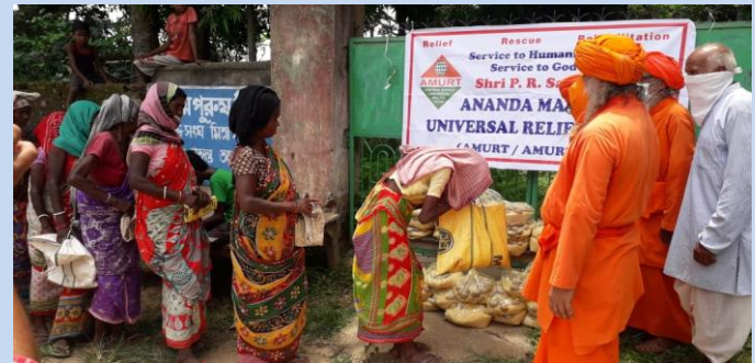
Relief on 11 th August at Guridih and Korche villages, about 150 persons benefited