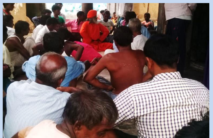
At Sirkabad Village on 23 rd August and five persons learned spiritual meditation.