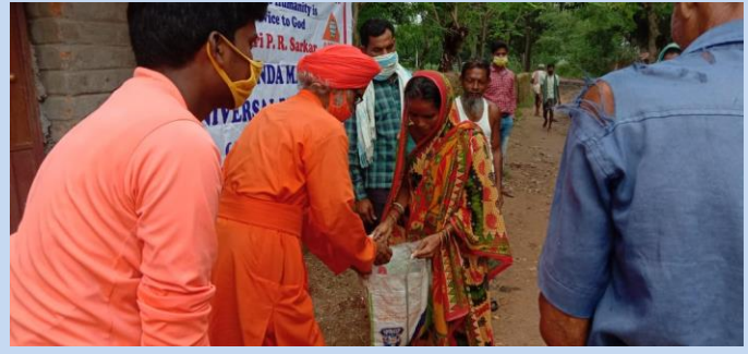
Relief on 23 rd August at Ukma and Natunrola village, about 240 persons benefited