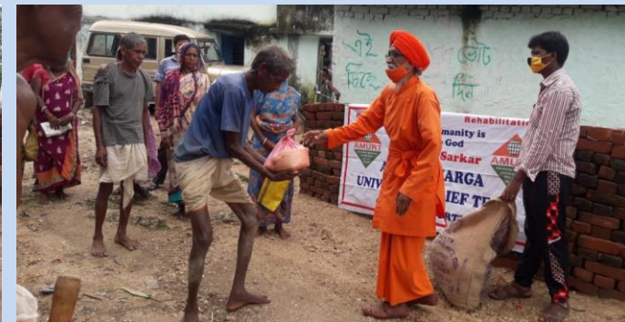
Relief on 28 th August at Chowkibera village, about 245 persons benefited