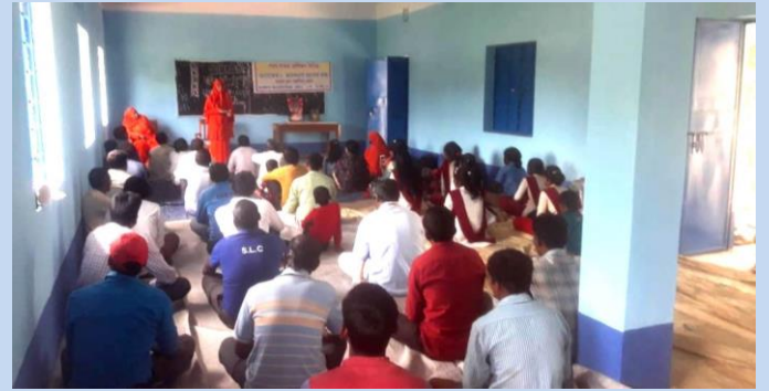
At Goradag Higher Secondary Higher Secondary School of Ashra village where 80 persons attended and 12 persons took initiation.