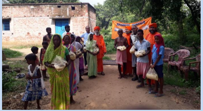
Relief on 13 th August at Sidhi, Jeladih, Layadih, Kashipur, Gopinathpur and Narandih villages, about 1200 persons benefited