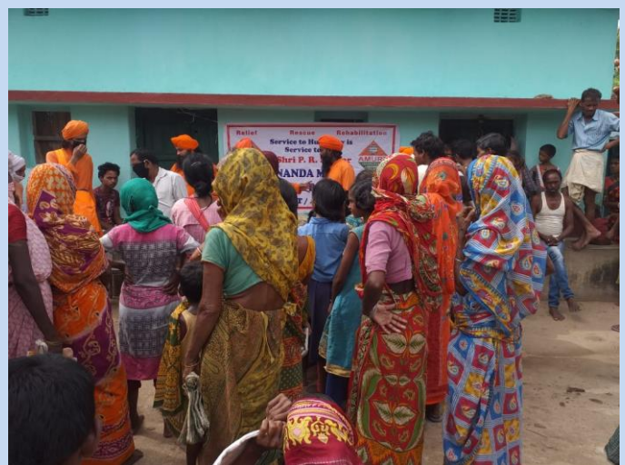
Relief on 14 th August at Jorro and Simatar villages, about 1200 persons benefited