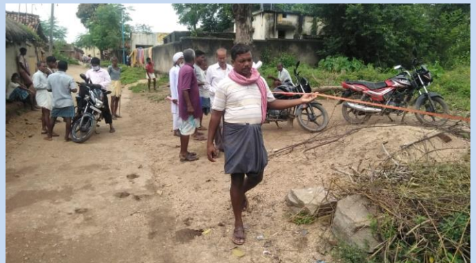
On-going land measurement