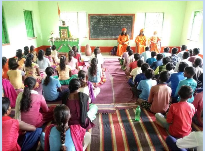
Coaching classes at Damrughutu Village