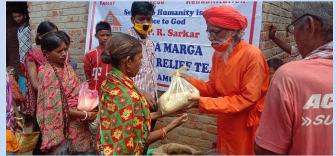
Relief on 24 th August at Siyalgara village, about 240 persons benefited