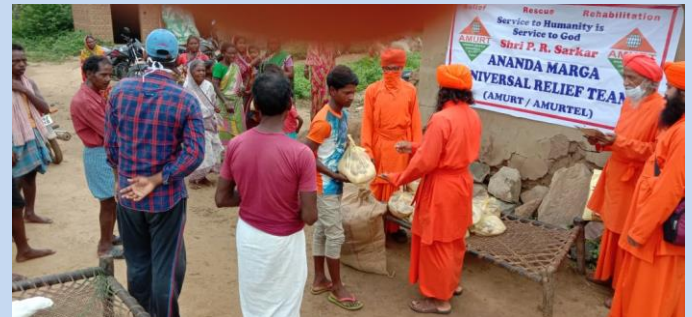
Relief on 12 th August at Layadih and Barometryala villages, about 240 persons benefited