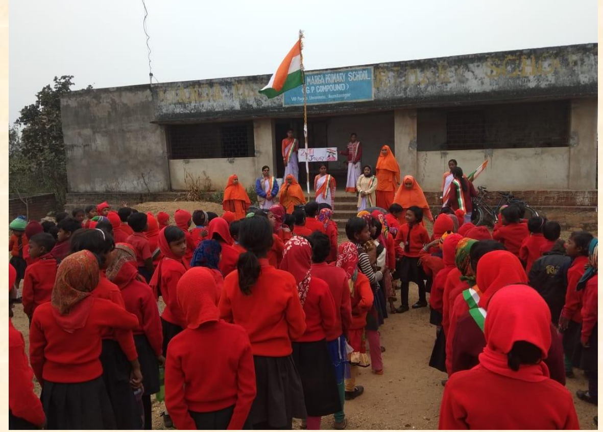
Ananda Marga Primary School at Pogro

Republic Day observed by Ananda Marga Primary School at Pogro and Ananda Marga Girl's High School on 26<sup>th</sup> January.