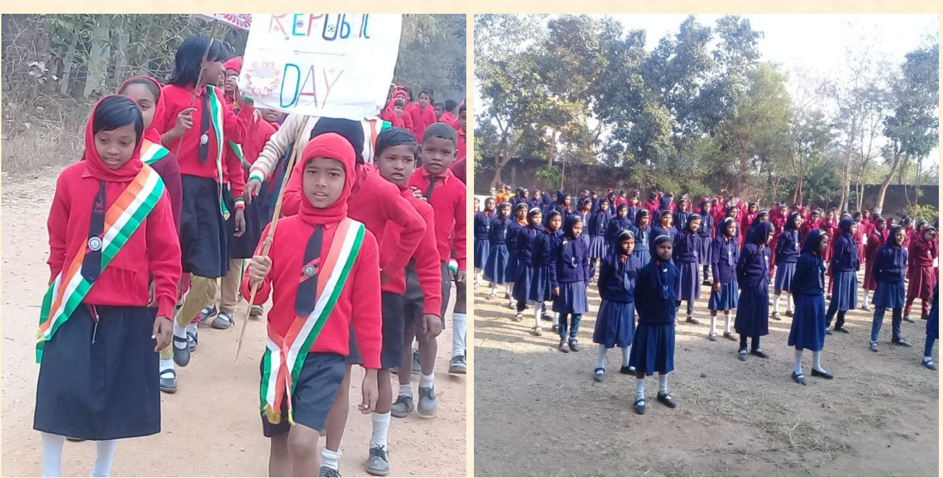
Ananda Marga Girl's High School

Mass feeding by VSS On 27<sup>th</sup> January at Chakudih Village there Volunteers Social Service served food to villagers.