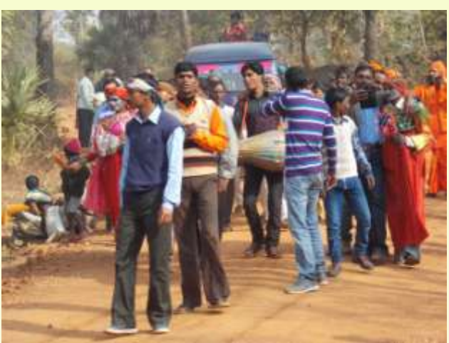
Cultural programme during DMS

Cultural program was held during the new year DMS on 1st, 2n and 3rd January at the DMS platform.