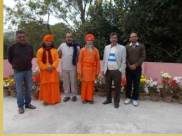
Expedition of Whole timers to the origin of Kangshavati River

On 20th December 2015 a team of Dadas went to find out the starting point of Kangshavatii River which is one hour walking distance from nearest village named Simmi and Jabar of Anandanagar Diocese.