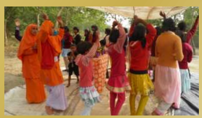
Kiirtaana at Palashdih village