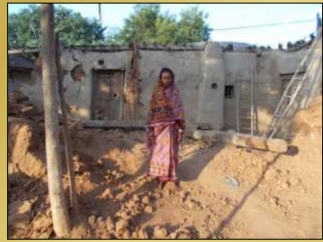
Tantrapiitha near the source of the Kangshavatii River

A Tantra piitha near starting point of Kangshavatii River of Rarh was found at the village Sain dera (dwelling place) where Sufi Md Sain Baba used to perform meditation. Every year People of Muslim community gather there and observe their festival.