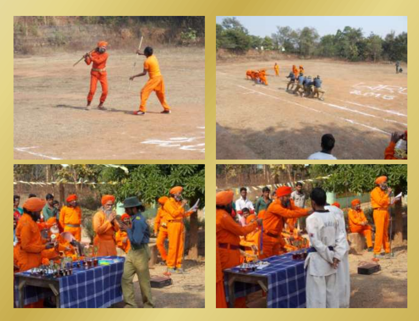
Seasonal flowers at the roof of Rector Master's Office

The roof of Rector Master's office is decorated with seasonal flowers.