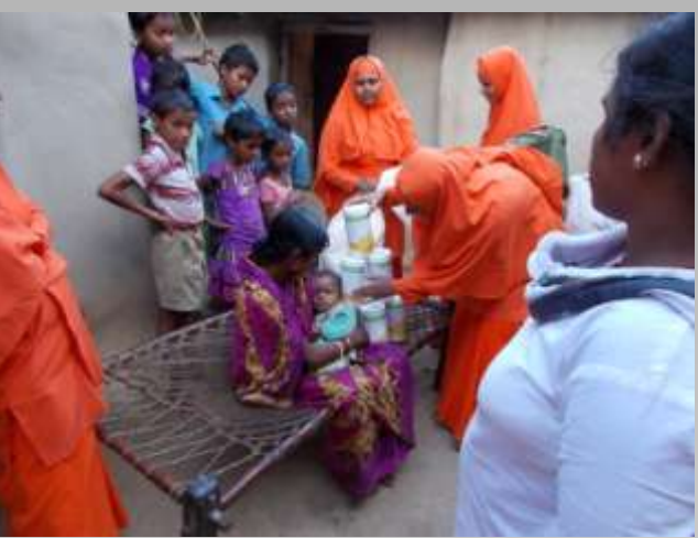
Annual cultural Programme at Bakul Vitan

Madhya Anandanagar primary school celebrated Annual Cultural program at Bakul Vidan, Pundag on 15 October