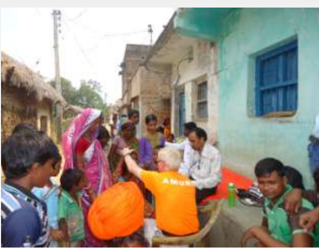
Medical camp at Chhatka village