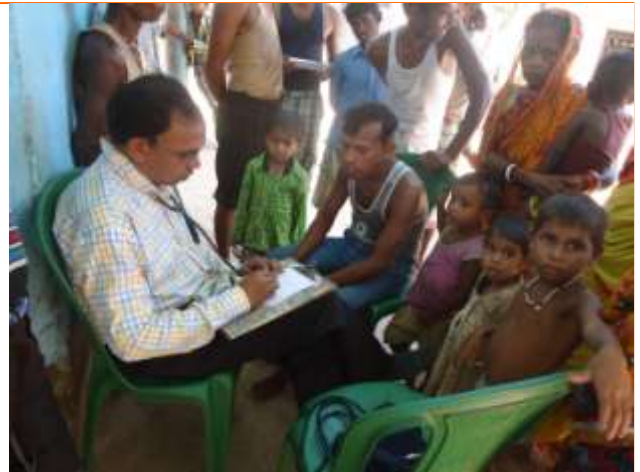
Medical camp at Tatuwara village