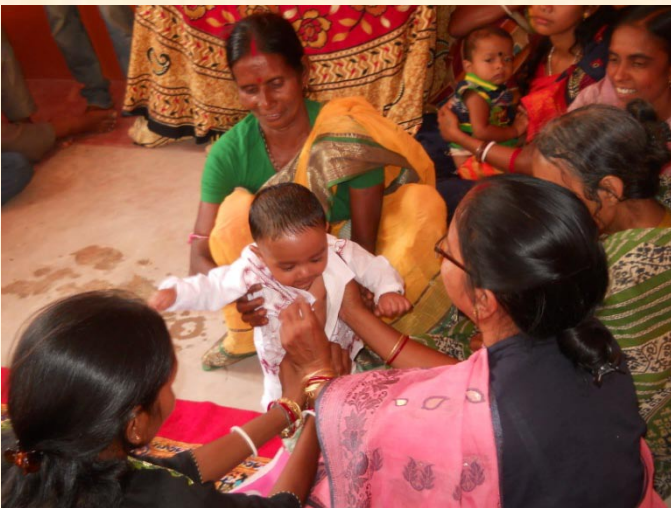
At Damrughutu village