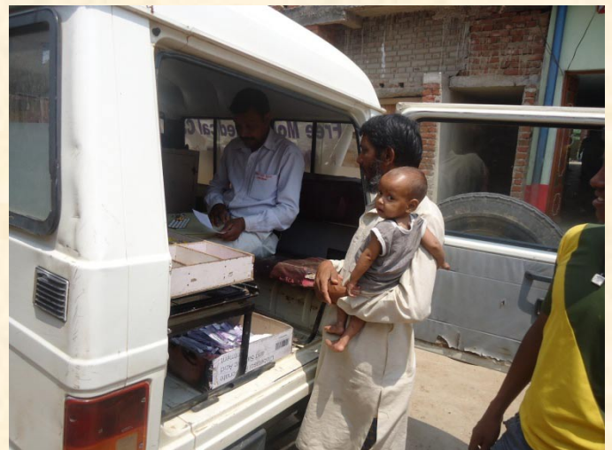
at Amirdih village