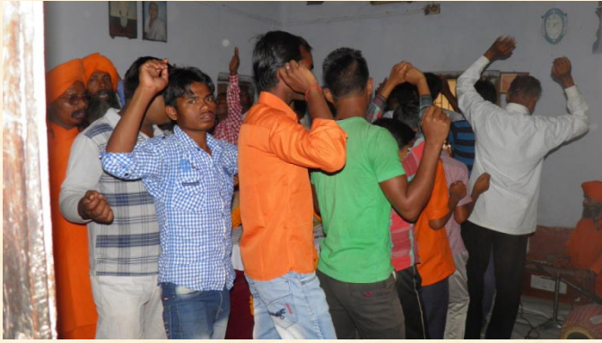
At Chitmu village