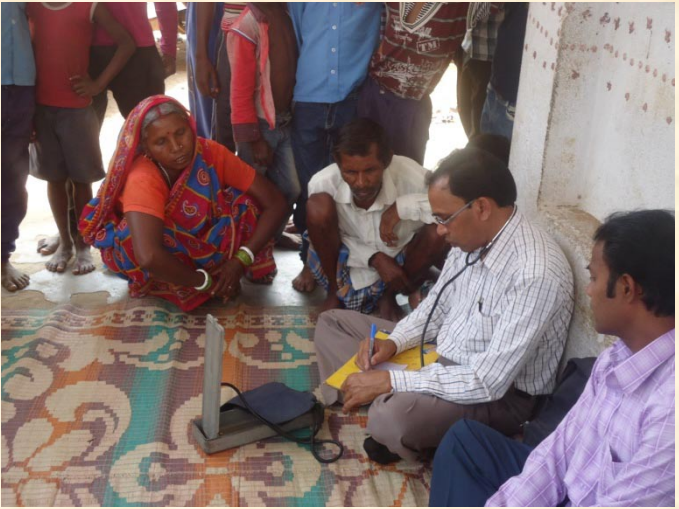
Medical camp at Amuramu village