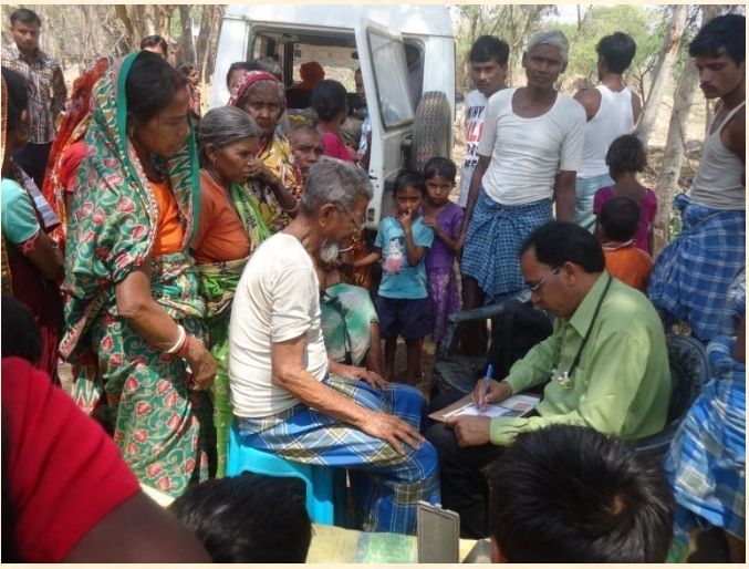
Medical camp at Maramu village