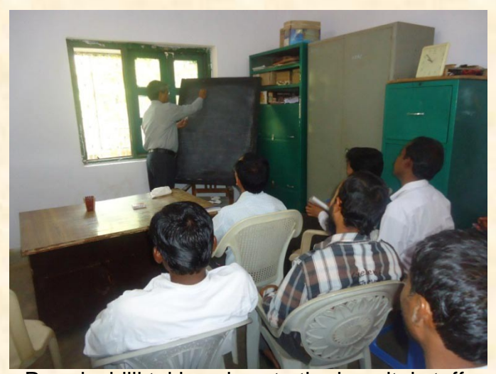
Paradeshijji taking class to the hospital staff