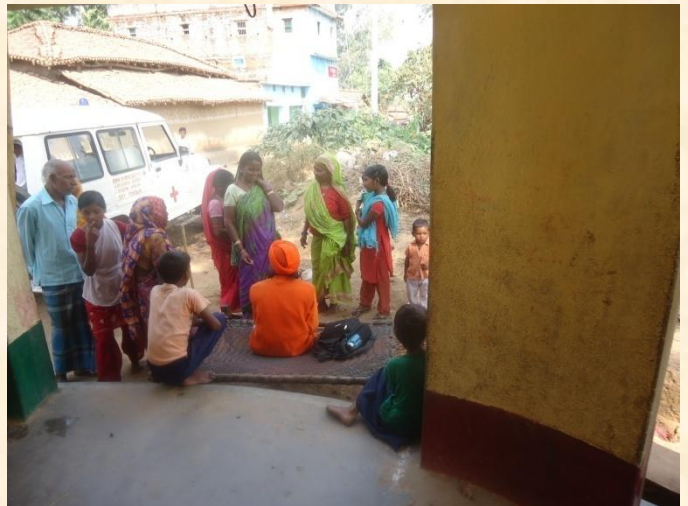
Medical camp at Damru Village