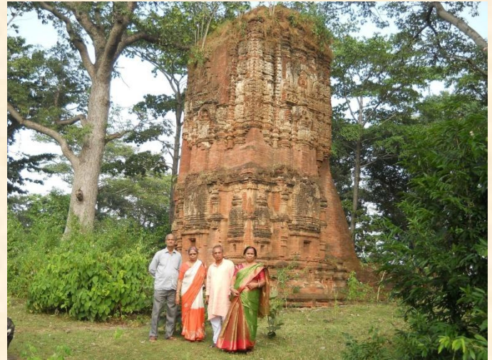
Margii Visiting Anandanagar