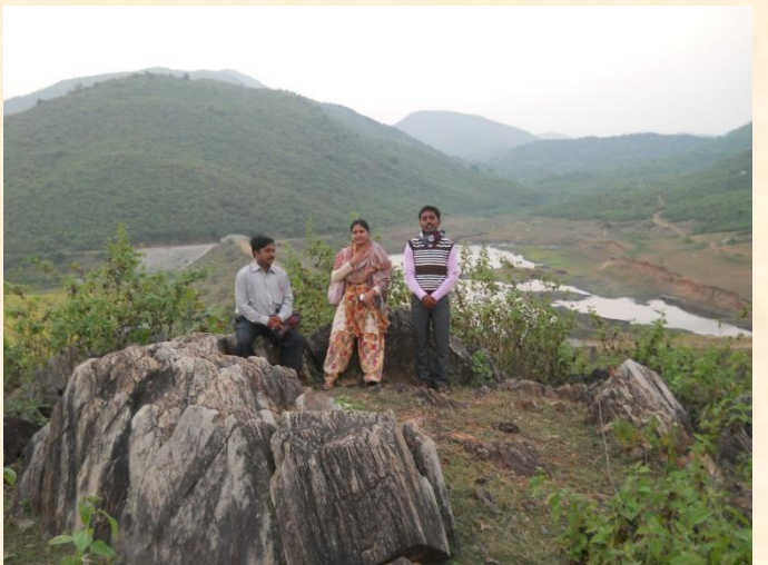
Non-Margii Visiting Fossil hill