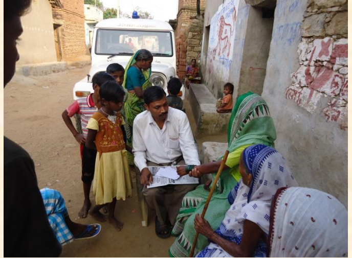
Medical camp at Shyampur Village