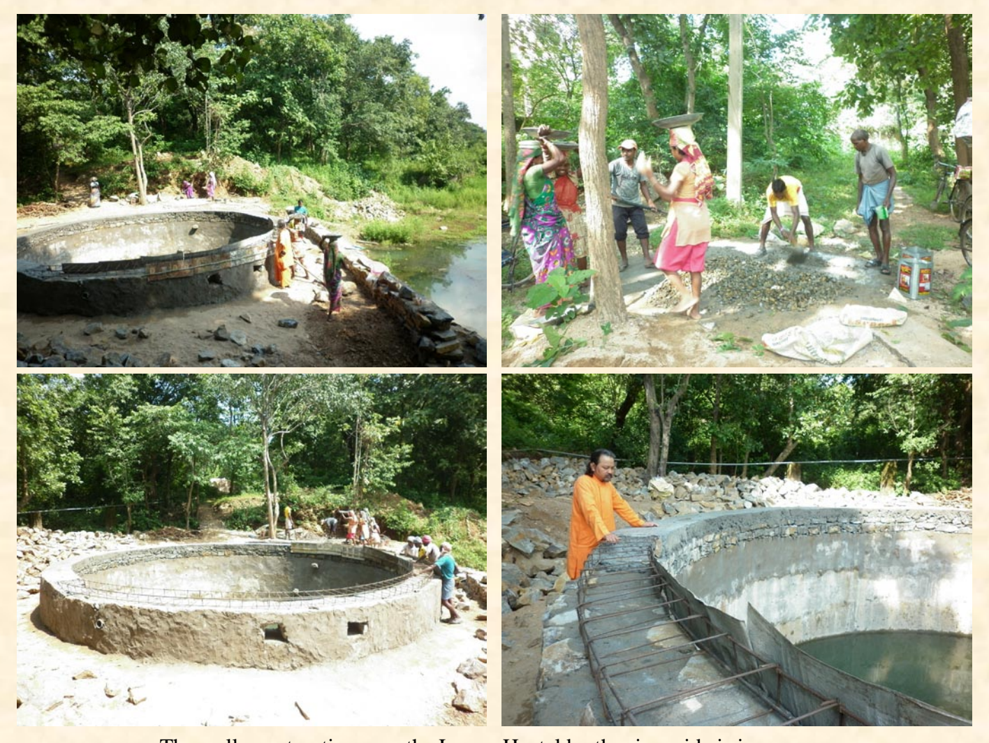
The well-construction near the Lower Hostel by the river side is in progress.