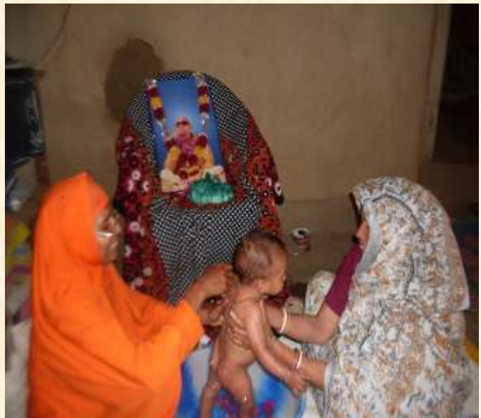
First rice feeding day and naming ceremony

On 13<sup>th</sup> March first rice feeding day and naming ceremony was held at Chitmu village of no.3 Dharma Cakra unit at Jagriti according to Ananda Marga Caryacarya. On that occasion 3 hour Kiirtan was also held.